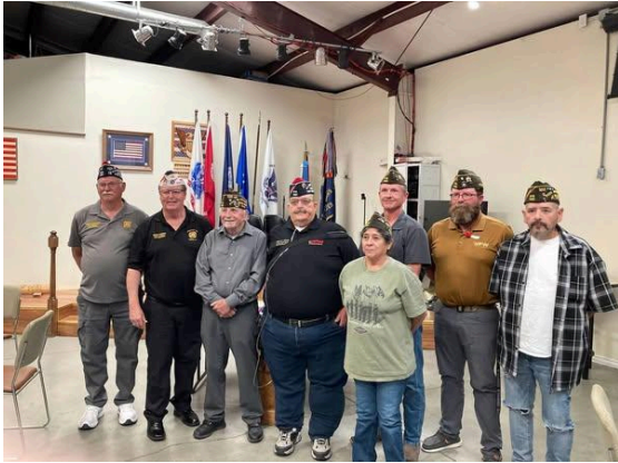
Congratulations to our new Post Officers 2025-2026.