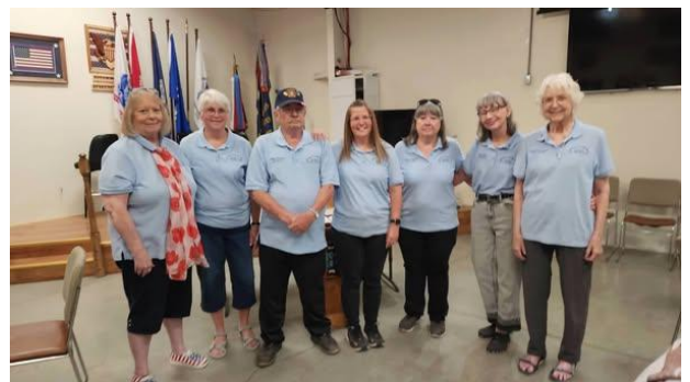
Congratulations to our new Auxiliary Officers 2025-2026.