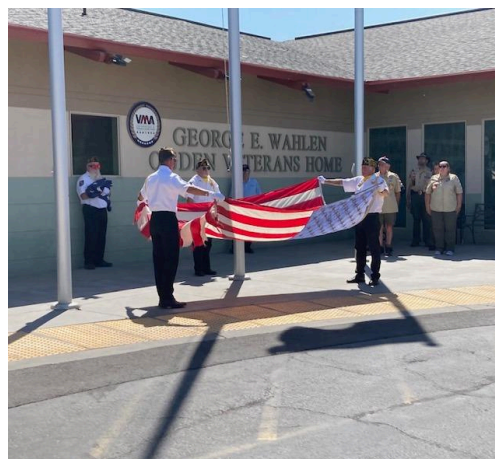
Flag Retirement Ceremony at George E. Wahlen Veterans Home.